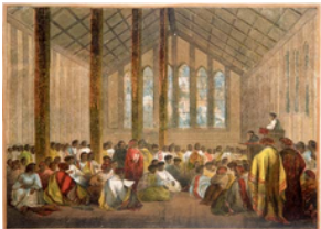
A Maori Christian church at Tauranga in the 1850s.