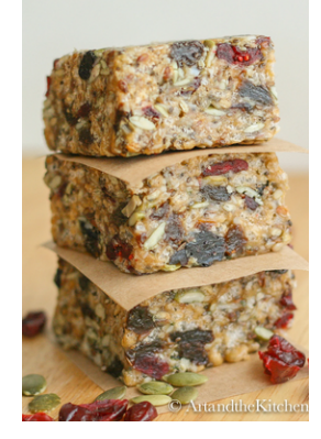
Fuel to go! Homemade protein bars that are tasty.

https://www.artandthekitchen.com/fuel-to-go-homemade-protein-bars/