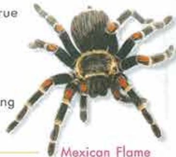
Mexican Flame Knee Tarantula