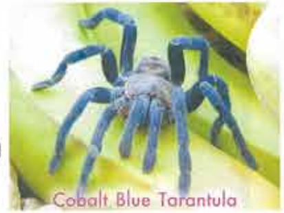
Cobalt Blue Tarantula